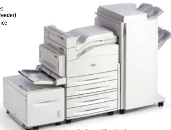
B930dn shown with optional 1,000-sheet Tabloid/A3 tray, 2,000-sheet High-Capacity Feeder, and Stacker/Finisher