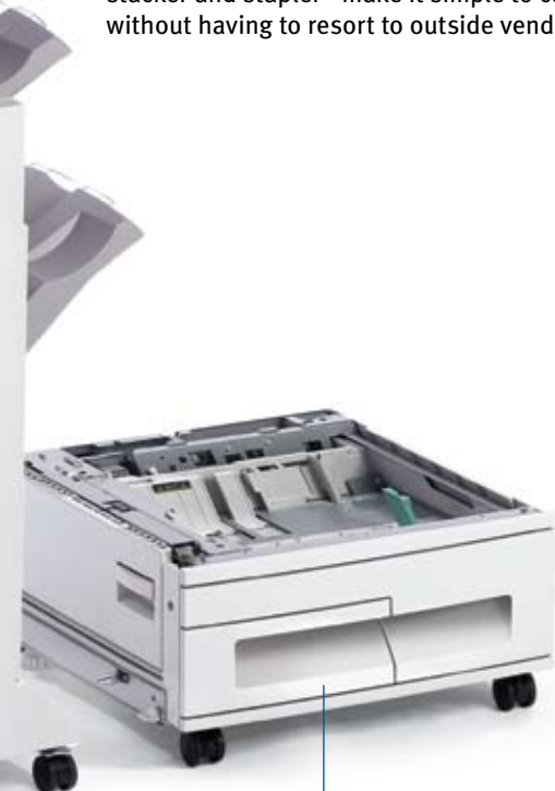
Optional 2,000-sheet Letter/A4 Tandem Tray

Quality, performance, efficiency and support: proof that the B930 Series from OKI Printing Solutions is the answer to your high-productivity network printing needs.